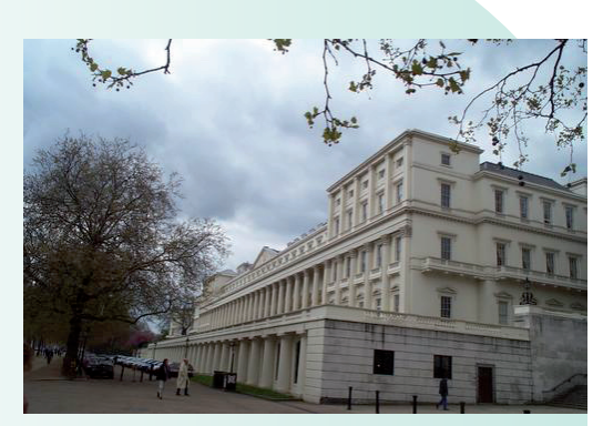
The Royal Society in London

To prepare this meeting, a selection of Scholars and Instructors from past programmes, as well as Nippon Foundation and POGO representatives will meet on 20-22 October 2010 at the Royal Society in London. As well as planning the 2011 Meeting in detail, the participants will discuss ideas for setting up and maintaining the global network of scholars, and research ideas for projects that could be undertaken by this future network.