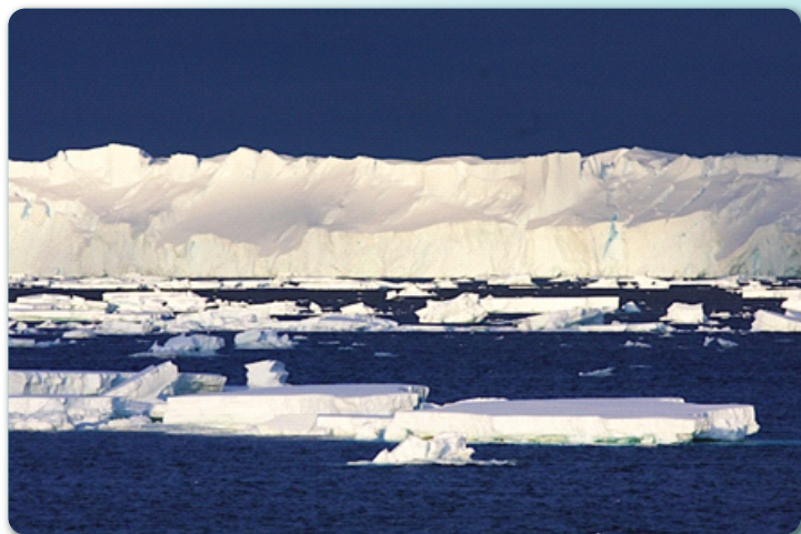
FIGURE 1 | Totten Glacier in East Antarctica.

The OASIIS Working Group is a community of scientific researchers working together to improve observations and our knowledge of the oceans beneath Antarctic sea ice and ice shelves.