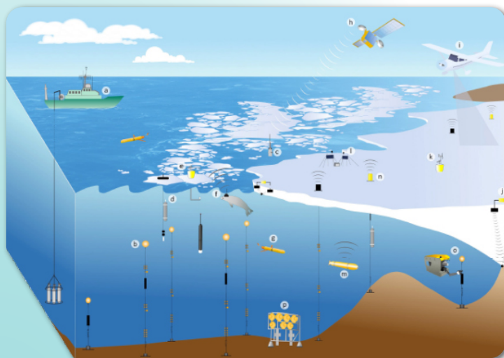
FIGURE 4 | Observing system for an ice shelf includes: ships (a); moorings (b); ice-capable floats (c); ice-tethered profilers (d); ice-mass buoys (e); seal tags (f); gliders (g); satellite (h) and airborne (i) missions; ApRES radars (j); automatic weather stations (k), GPS (l), AUVs (m); instrumented boreholes (n) moorings deployed by ROV (o) and bottom landers (p). From Newman et al., 2019 .

level rise, the impacts of climate change on Antarctic and Southern Ocean marine ecosystems and fisheries, and an ability to track global budgets of ocean heat, freshwater and carbon. Increasing our understanding of these remote ice-covered regions will provide stakeholders, such as the Antarctic Treaty System, the Partnership for Observation of the Global Ocean (POGO), the Commission for the Conservation of Marine Living Resources (CCAMLR), the international scientific community, policy makers and governments with the knowledge required to manage and preserve Antarctica and its surrounding oceans for future generations.